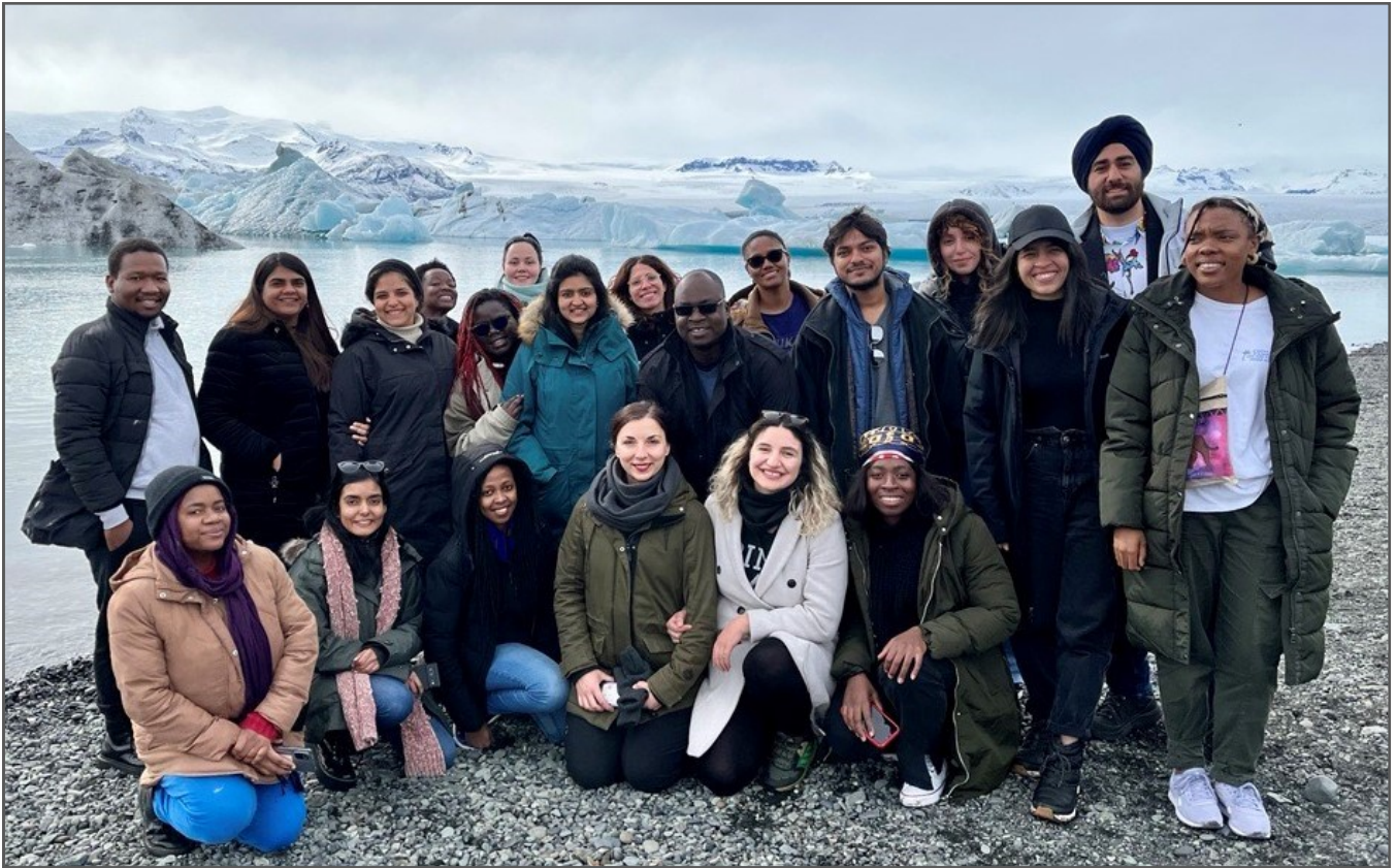
GEST 2022 cohort at Jökulsárlón