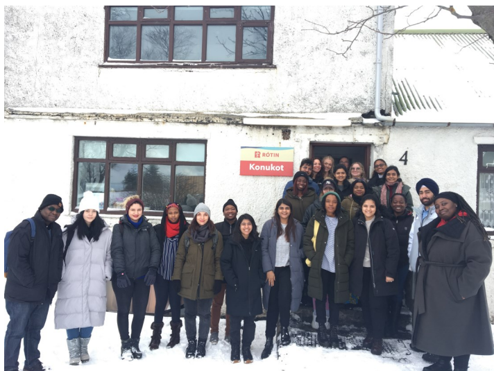
GEST 2022 cohort visiting Konukot

Off-campus the cohort visited Konukot shelter for homeless women and Stígamót Counseling Center for survivors of sexual violence, as well as leading themselves on a writing retreat/relaxation weekend at the university's Laugarvatn campus - only an hour outside town but a world away in terms of nature, calm, and quiet.