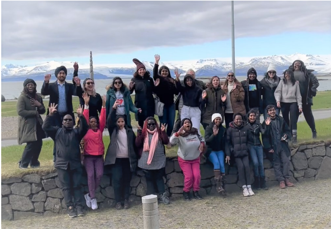
The GEST 2022 fellows during the field trip

The fellows went on the yearly field trip to the south coast of Iceland on a beautiful weekend in May and enjoyed major sites along the way east to Höfn in Hornafjörður, such as Reynisfjara (known as „the Black Sand Beach“), the waterfalls Seljalandsfoss and Skógafoss and Jökulsárlón glacial lagoon. At Höfn in Hornafjörður, the fellows met with representatives from the Research Center at Höfn to discuss the effects of climate change on Iceland's glaciers, followed by a visit to the glacier Fláajökull to directly connect with their experience in Höfn.