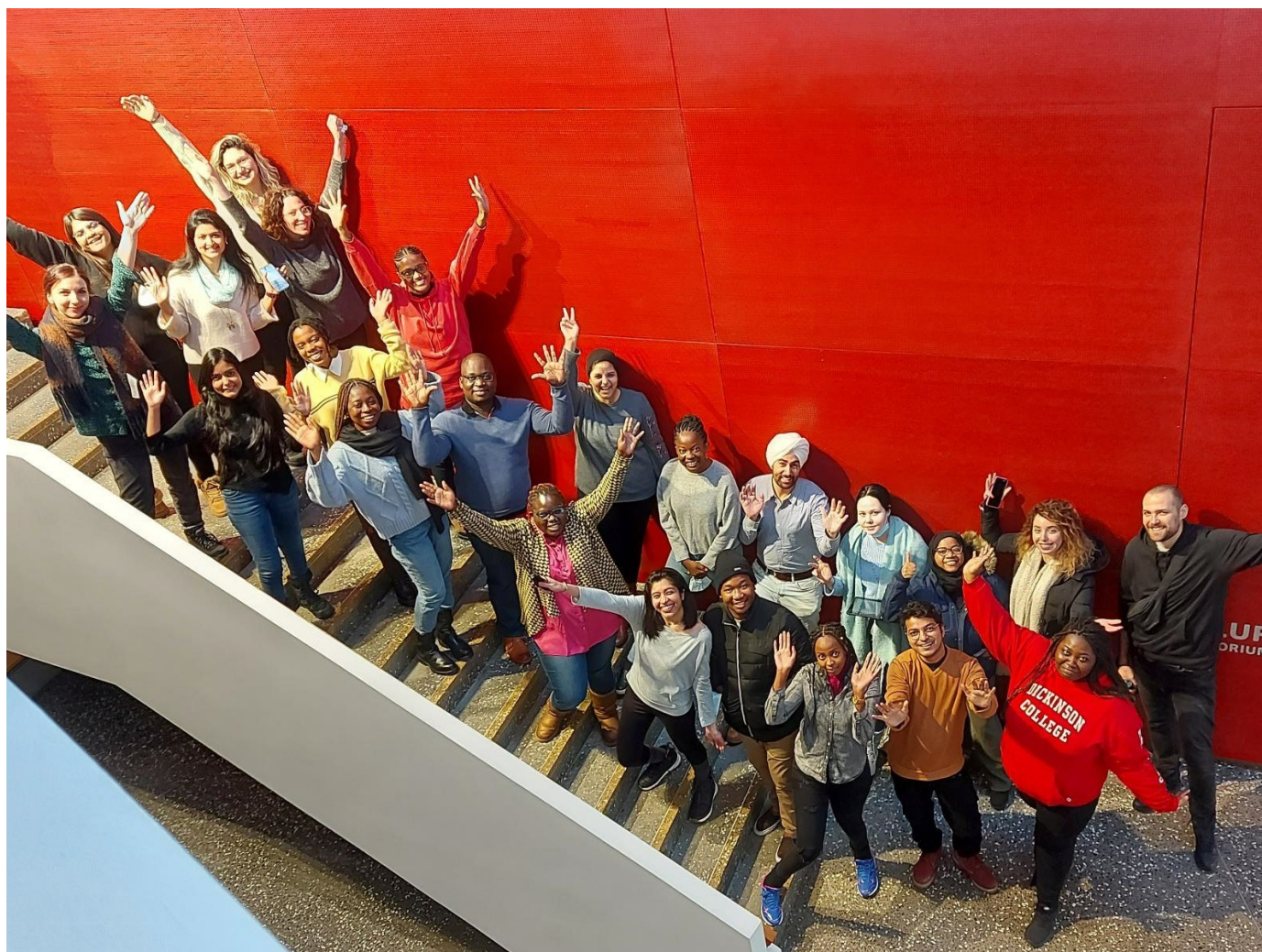
The GEST 2022 cohort

In 2022, the GEST team welcomed the new cohort of fellows in and around mid-January, and although Covid-restrictions were still in effect, they were milder than before and travel was generally not problematic. One fellow was required to quarantine for a week upon arrival (as compared with nearly half of the cohort that arrived in August the year before). The 2022 cohort consisted of 23 fellows, from 15 countries in Africa, Asia and Eastern Europe. This year, for the first time, Zimbabwe, Pakistan, and Moldova were represented among the GRÓ GEST fellows.