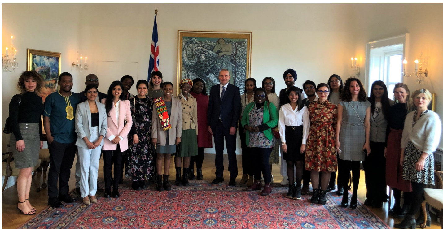
GEST 2022 cohort with the President of Iceland at Bessastaðir