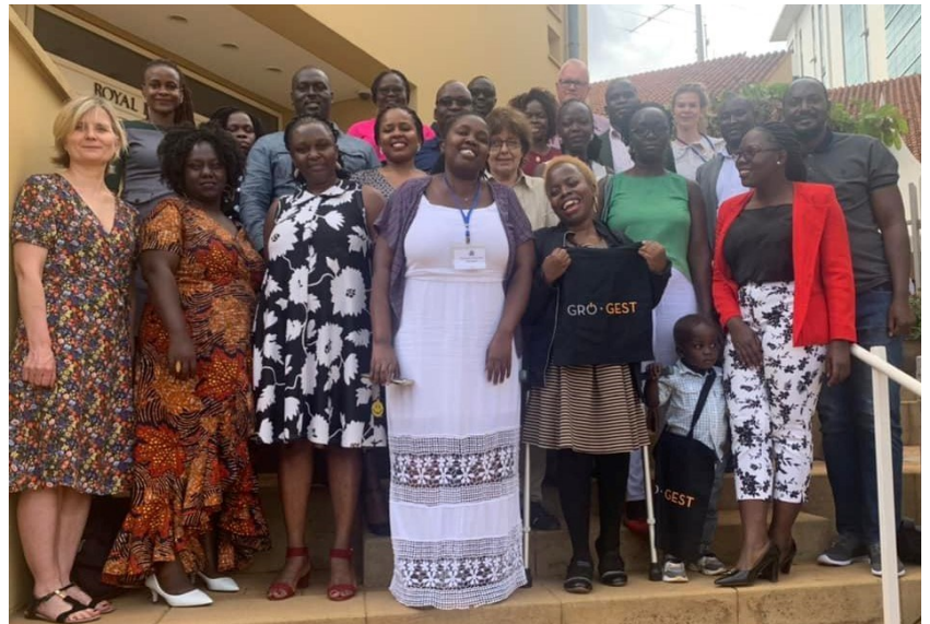
GRÓ GEST representatives, and the Head of Mission of the Icelandic Embassy in Kampala with the Ugandan GEST alumni

Development Initiative, an NGO that promotes the rights of girls, women, and female youth with disabilities to live a dignified life. The meeting created a platform for the alumni to strengthen their connections and share their professional experiences, as well as strategizing the way forward for the Ugandan alumni network. As a network, they are currently in the process of forming a formal association which can facilitate their common goal: advancing gender equality in Uganda.