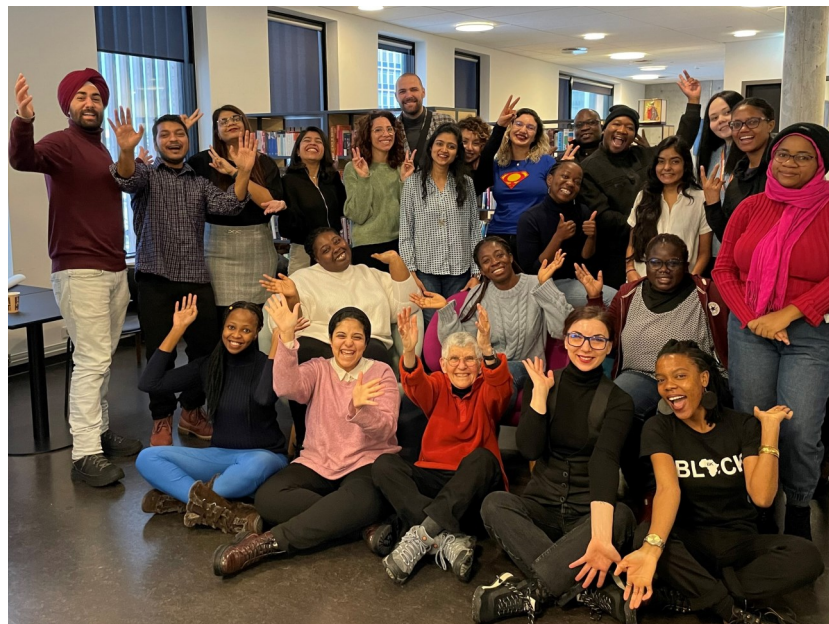
The GEST 2022 fellows with Dr. Cynthia Enloe