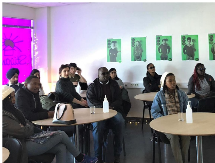
GEST 2022 cohort visiting Stígamót