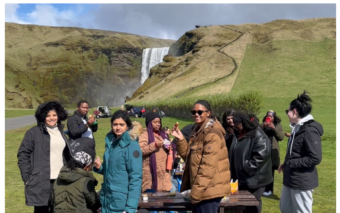
GEST fellows enjoying a snack by the waterfall Skógafoss