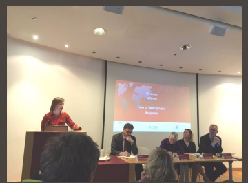
Marriët Schuurman, Ambassador and NATO SGSR for WPS took part in the opening panel of Inclusive Peace — women, peace and security post 2016.